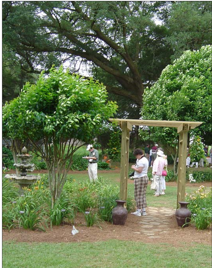
Taking Notes! At the Region 14 Spring Meeting, "Garden Judges" evaluate daylilies in the Hileman garden.