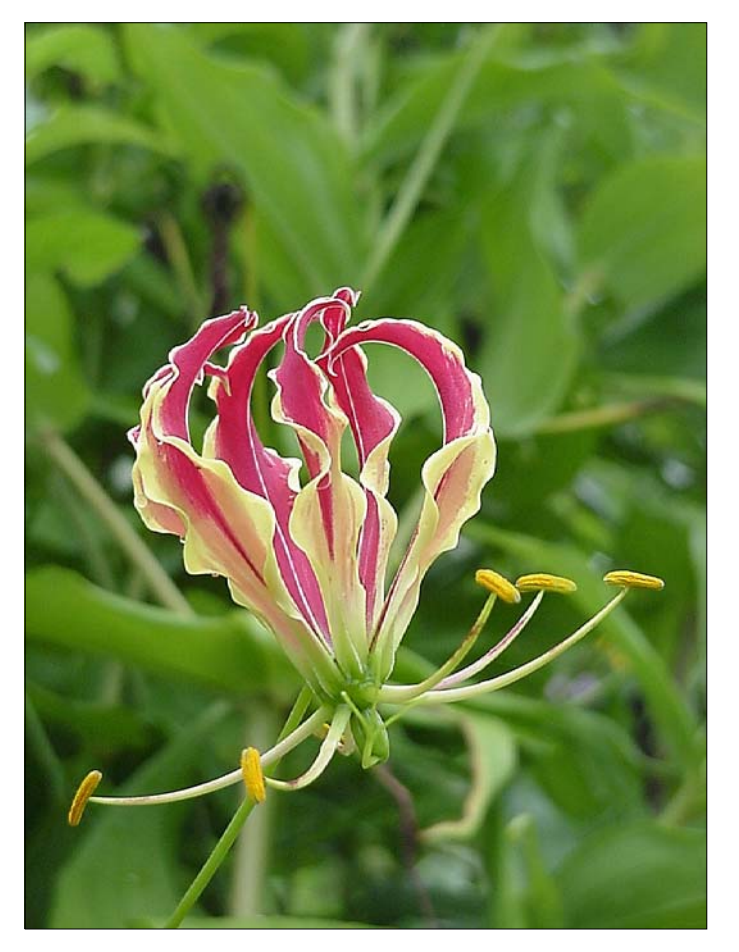
loriosa lily is an exotic climbing lily from tropical oldsymbol{J} Africa. Its waxy, long lasting flowers are valued for flower arrangements.