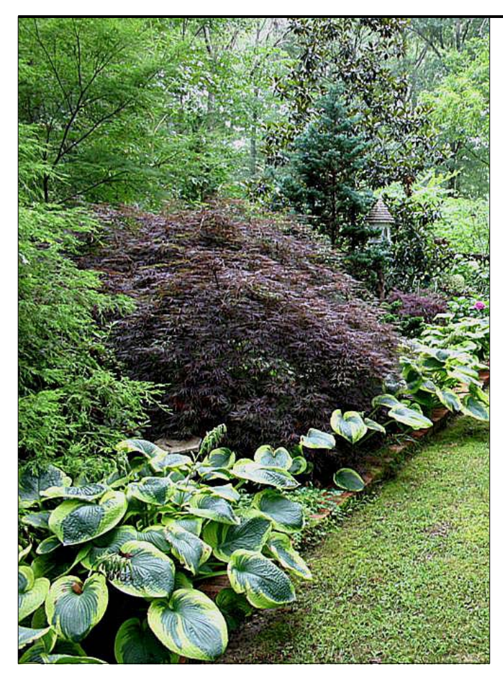
Large specimens of hosta "Frances Williams" were most impressive, along with cedars, blue spruce, and an array of Japanese maples.

sport of "Sum and Substance" found in England. Japanese painted fern were in abundance throughout the garden, as were plantings of white and pink-veined caladiums.