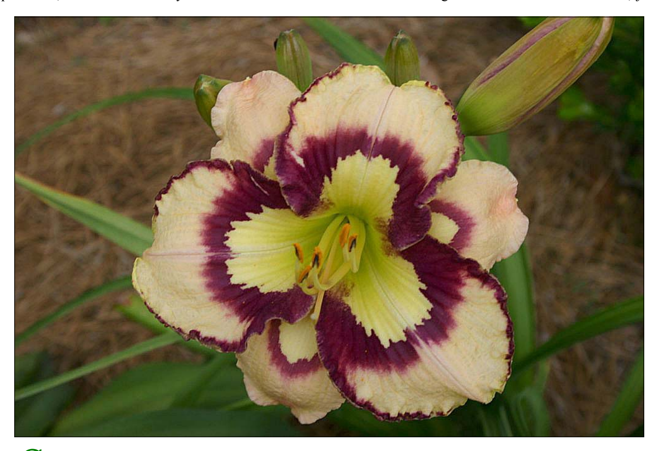
SPACECOAST SEA SHELLS (2003) offered this distinctive bloom in John Falck's garden during the Region 14 Spring Meeting in Foley. Its celery-colored "appliqué" eye pattern on both petals and sepals contrasts nicely with its dark purple eye and edge.

On several occasions during the past couple of years, I have been able to visit their home near the "spacecoast," for which so many of their recent cultivars are named. Their garden is located in Scottsmoor, just a