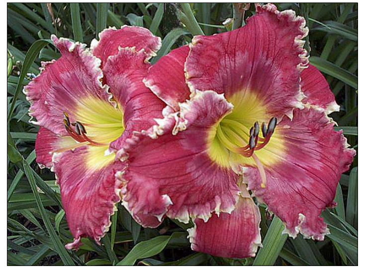
In Linda's quest to create red daylilies with white shark's teeth edges, RUBY CLARE MIMS is a beauty.