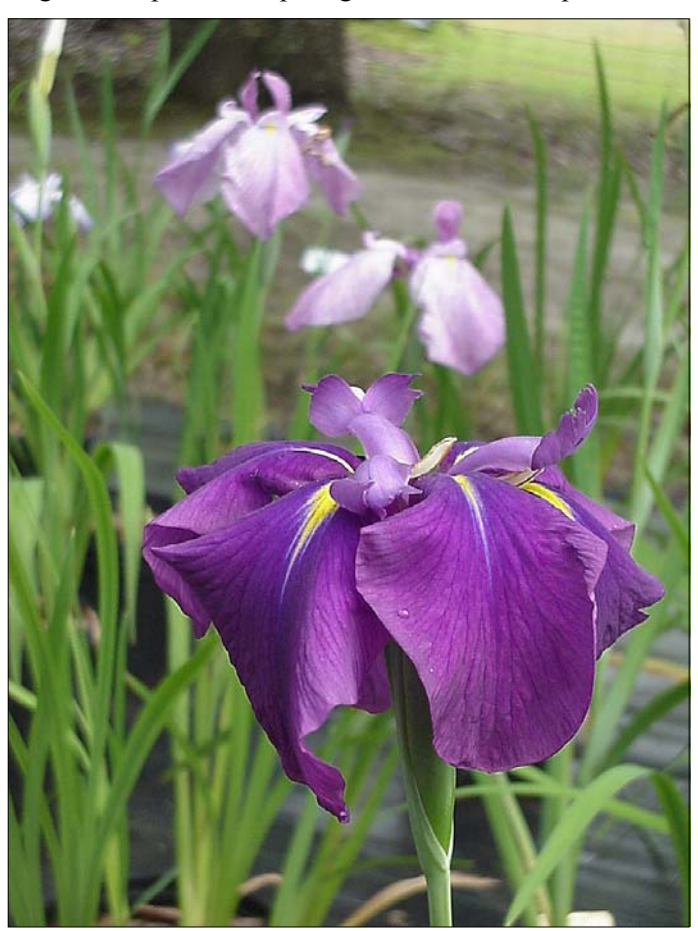
apanese iris, such as "Royal Robes," make good companion plants for daylilies, accentuating colors such as purple, blue, and magenta.

Large shrubs can also be trained to small trees. "Natchez" crape myrtles (Lagerstroemia indica) develop beautiful bark and bloom with white blossoms. New varieties such as "Pink Velour" bloom with