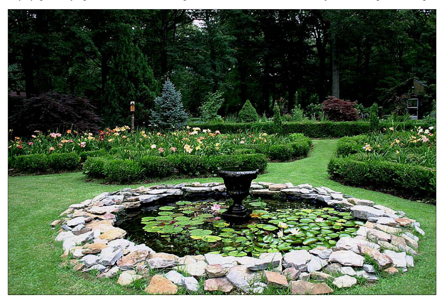
The centerpiece for the Stephens' large garden is this beautiful waterlily pool featuring a large urn and surrounded by field stones gathered from a farm in Tennessee. Daylilies are arrayed in an almost Neoclassical manner in this portion of the large four and a half-acre garden.

Randy and Karen do all the work themselves, maintaining a garden that is the sort one often sees on tour at a National Convention. I was very impressed when I visited last June. There is plenty of shade for hostas and specialty hydrangeas, such as "Merritt's Beauty." Oregon grape, oak leaf hydrangea, and rhododendrons serve as under story in the wooded areas, and where there are pockets of sunlight the Stephens grow a number of varieties of Japanese maple. Some like "Bloodgood," "Crimson Queen," and "Red Dragon" in June show hints of their red foliage, which blazes even more intensely in the fall. "Waterfall" is an impressive green; "Butterfly," a variegated gray and green; and "Garnet," a green and burgundy blend. Of the several varieties of hosta, large specimens of "Frances Williams" were the most impressive, along with a bright