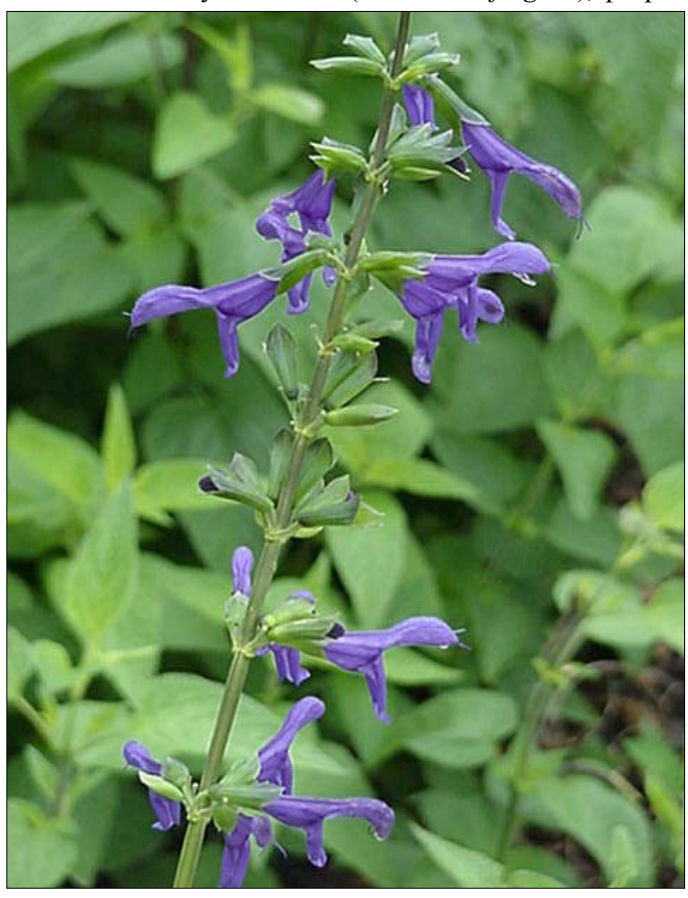
Salvia guaranitica is the species of which "Blue Anise" and "Argentina Skies" are varieties. "Blue Anise" has dark blue flowers.

Black-eyed Susans (Rudbeckia fulgida), purple