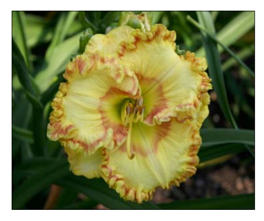
#FS-4-33 is typical of Frank's hybridizing program.