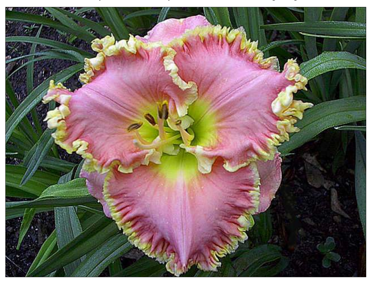
This exemplary orchid pink seedling, A2-TLAS-04, typifies Linda Agin's hybridizing program. Its beautifully formed blooms are saturated with color and feature a serrated edging of creamy chartreuse. It stems from a seedling of Tet LINDA AGIN x a seedling from Larry Grace.

From the beginning, her favorite varieties