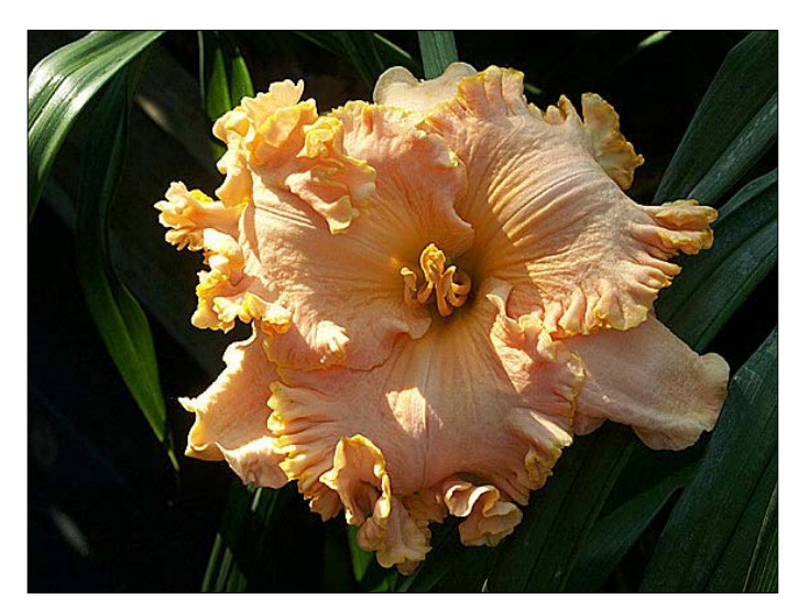
ROPICAL PASSION (2004) is a lavishly ruffled rich peach-melon.