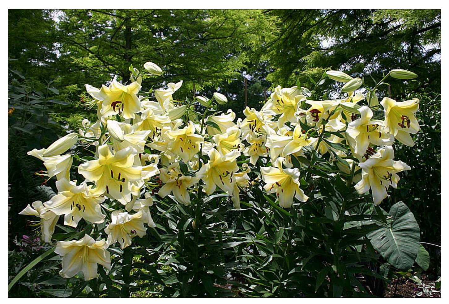
A siatic, Trumpet, Oriental, and Tiger lilies can provide additional texture in a garden designed around daylilies. This Oriental lily, "Conca'dor," was spotted growing in the St. Louis Botanical Gardens.