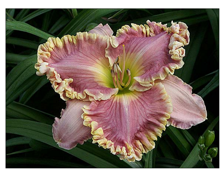
NN McWILLIAMS (2004) is a rosy lavender, with a creamy baroque edge.