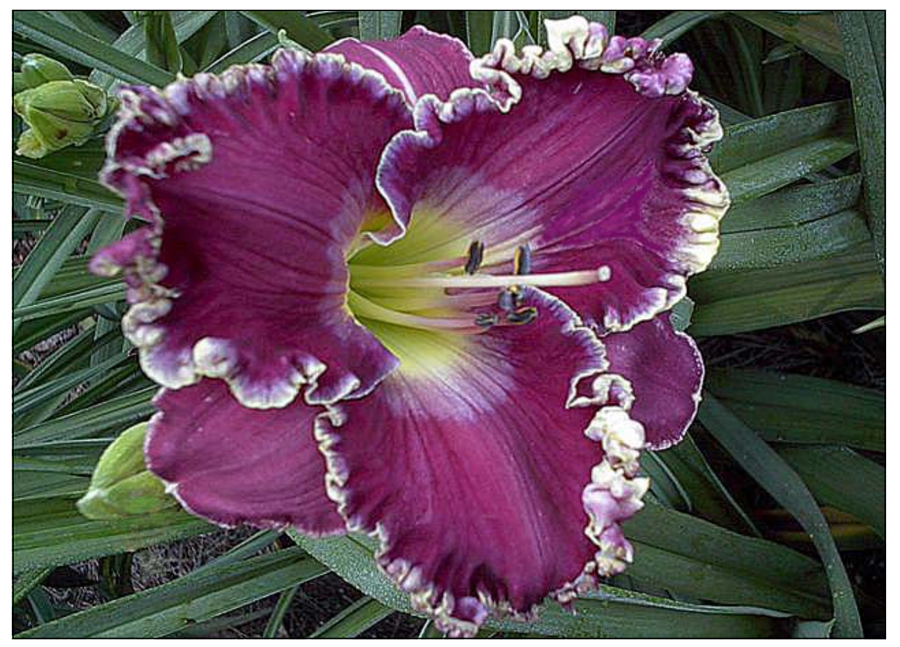
LINDA BECK (AGIN 2005)