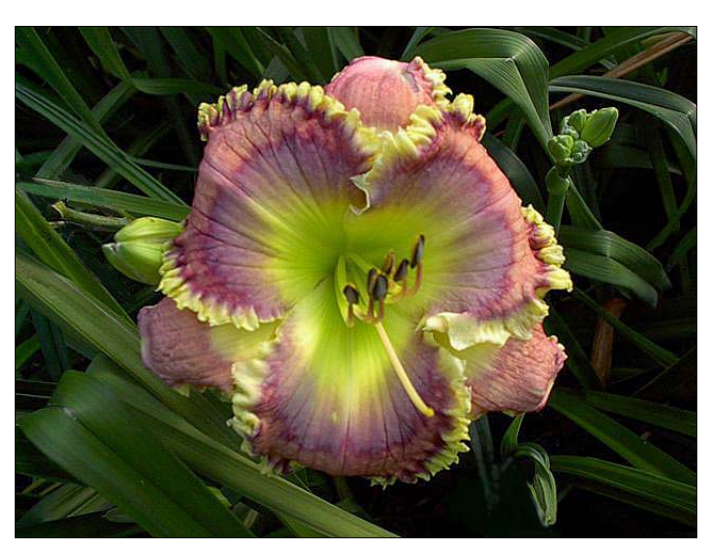
This rose with a large washed lavender eye shows off some shark-teeth as well.