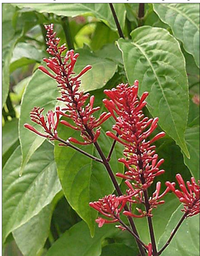
F irespike is highlighted by red spears of flowers. It is one of the few "hummingbird" plants that will bloom in sun or shade.

You can create a hummingbird buffet with cupheas and firespike. Cuphea ( C. ignea ), Mexican cigar flower, has tubular red-orange flowers that bloom May to frost. Cuphea ( C. micropetala ), a true giant up to 8 feet, blooms with candy corn blossoms from July to frost. A charming plant, cuphea ( C. llavea ), "Tiny Mice," looks like a little mouse with bright red ears and a purple nose. The giant cigar flower is probably the most cold hardy (zone 8) and the "Tiny Mice" the most tender. Firespike ( Odontonema strictum ) is absolutely vibrant in the garden. Beautiful tropical foliage is high-