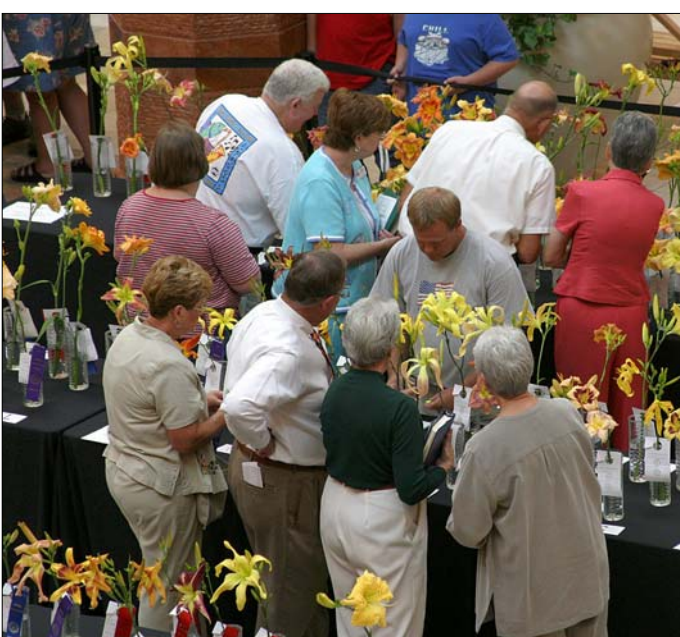
Talk about concentration! Exhibition judges evaluate entries during the Jackson Show, June 12, 2004.