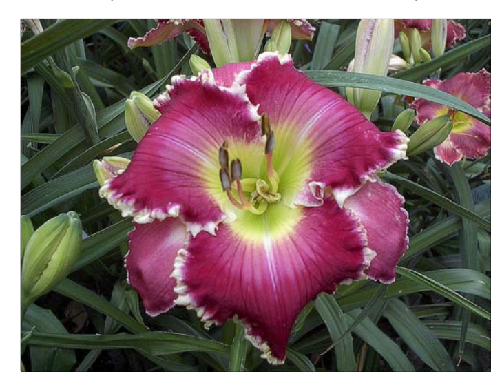
EAN CRANMORE is a rosy red with white shark-tooth edging.