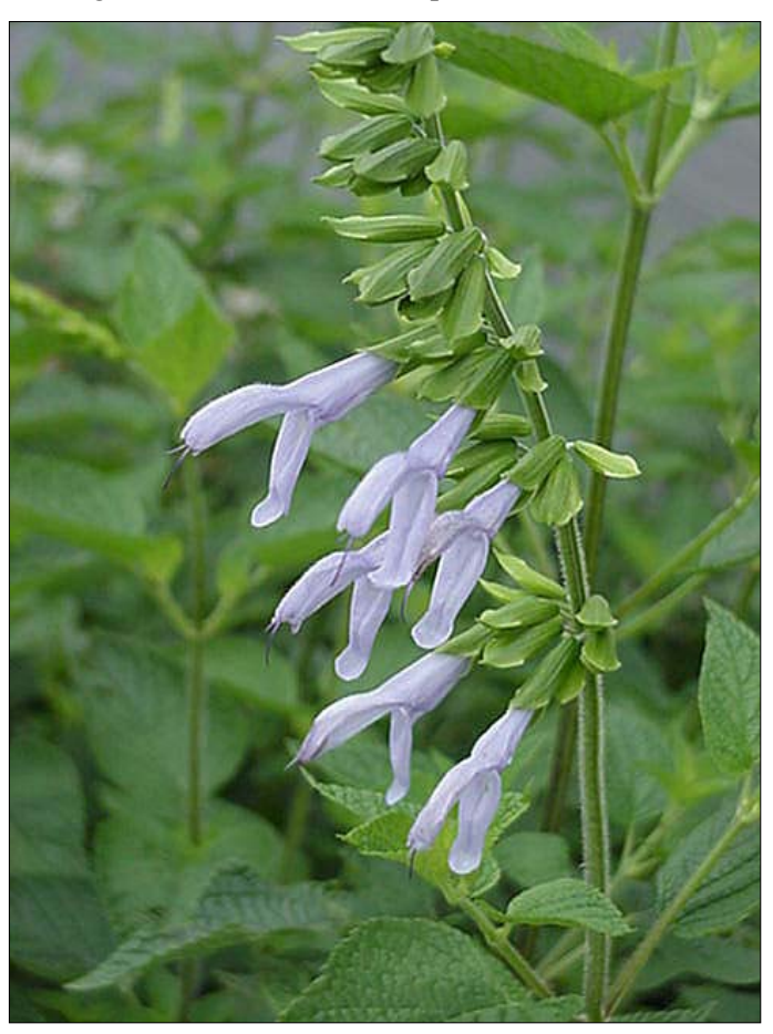
Salvia "Argentina Skies" sports sky blue flowers with a hint of lavender from midsummer to early autumn.

Some plants to intersperse with daylilies are Japanese iris, dianthus, and various annuals. Japanese iris bloom exactly when daylilies are coming into flower. They will clump and not spread like the Louisiana iris. "Bouquet Purple" dianthus, a MS Medallion Plant, provides almost continuous bloom. Some deadheading is needed, but it is a great performer remaining evergreen in winter. Annuals such as ducksfoot coleus and a trailing type of sun coleus are personal favorites. These plants provide foliage that spread into a colorful groundcover. Another plant to consider is the