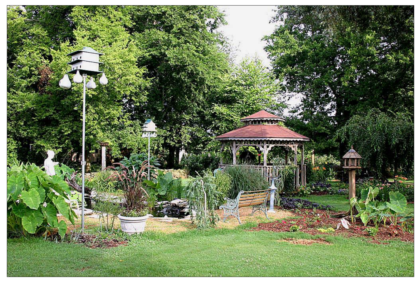
A wildlife habitat, the Thompson garden features plenty of birdhouses. A water garden, replete with Japanese koi and goldfish, is situated near the gazebo and enhanced by elephant ears and ornamental grasses. A statue of Hebe, the goddess who filled the cups of the gods with nectar, graces the water area.

In the shade area, hellebores and rhododendrons bloom in the winter, and there are several varieties of fern; some 50 to 75 native Alabama species of wild-